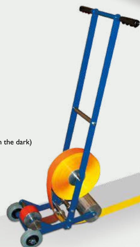
PermaStripe® lines are easily applied with a custom made applicator, available for sale or hire.