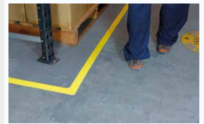
PermaStripe corners make a neat job of any intersection without the need to cut mitred corners.