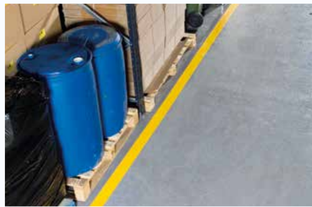
Aisle markings clearly show boundaries - improving safety and tidiness.