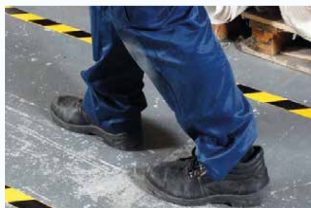
Unlike paint, PermaStripe® is durable yet easily removed.