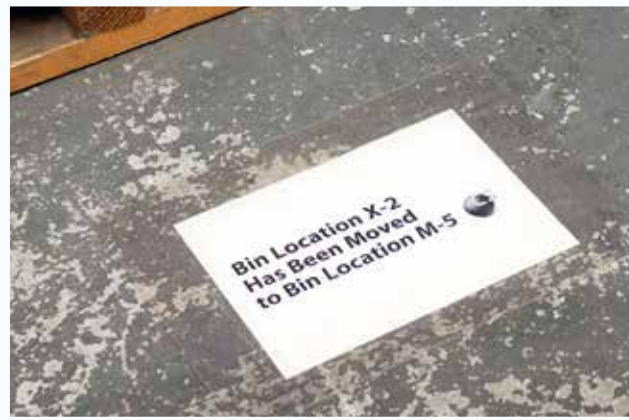
Bespoke permanent floor marking signs are instantly and immediately created with PermaCover, tough, durable and unique!

PermaStripe® is the World's most effective and durable aisle marking system. It is the modern alternative to resin and paint helping forward thinking companies achieve 5S status.