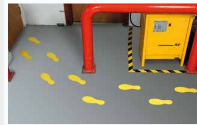
Any shape can be configured, we hold on our shelf PermaStripe® ready cut in letters, numbers and shapes. You can however choose any shape or character you prefer. Our cutting process is accurate to 0.1 mm